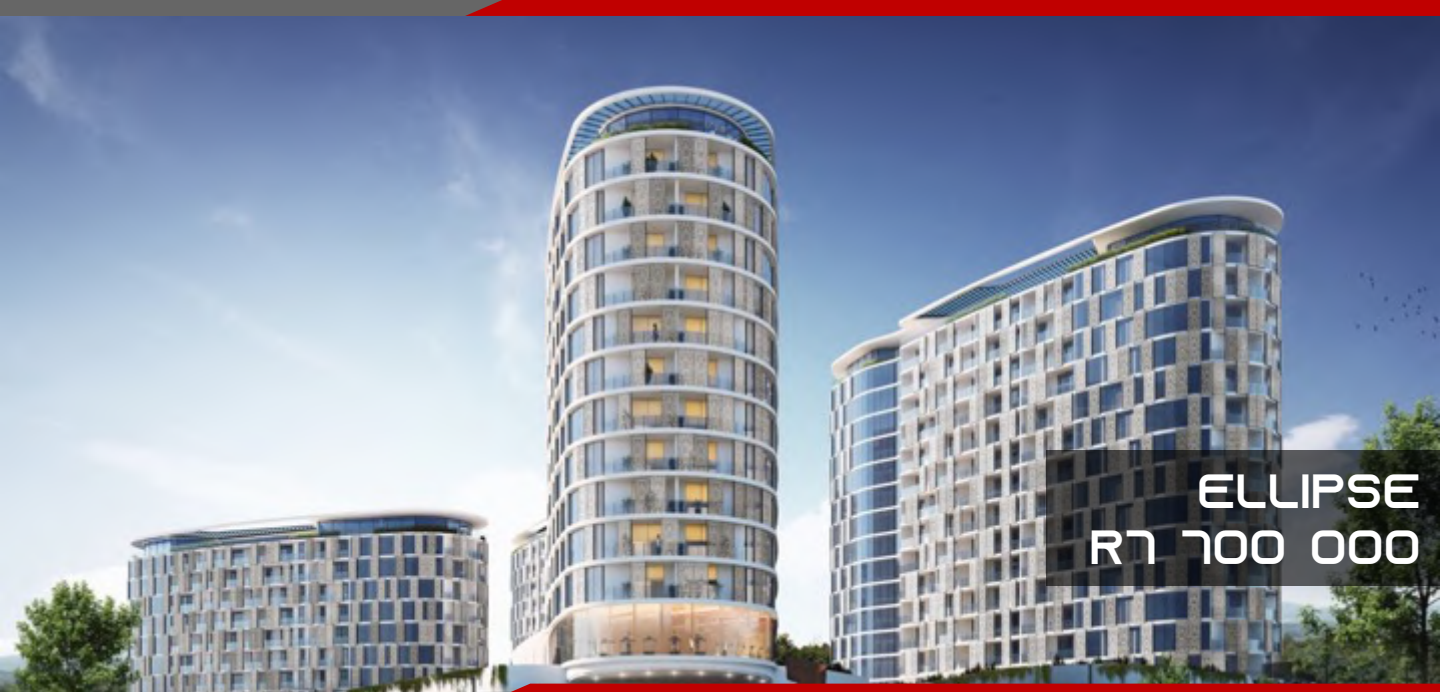
ELLIPSE R7 700 000