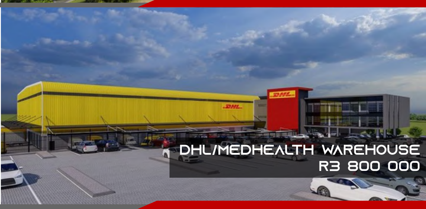
DHL/MEDHEALTH WAREHOUSE R3 800 000