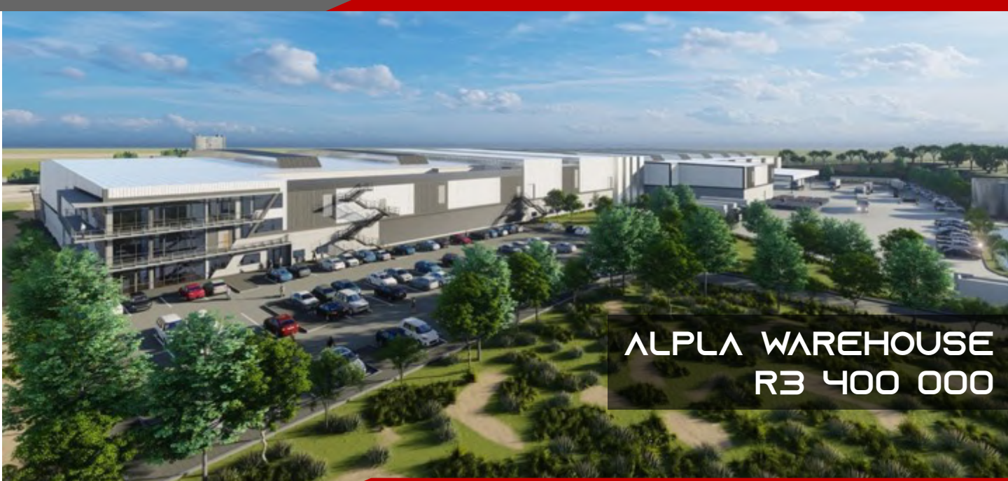
ALPLA WAREHOUSE R3 400 000