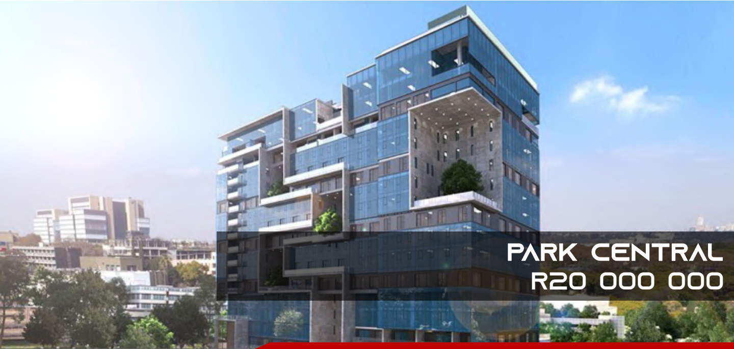
PARK CENTRAL R20 000 000