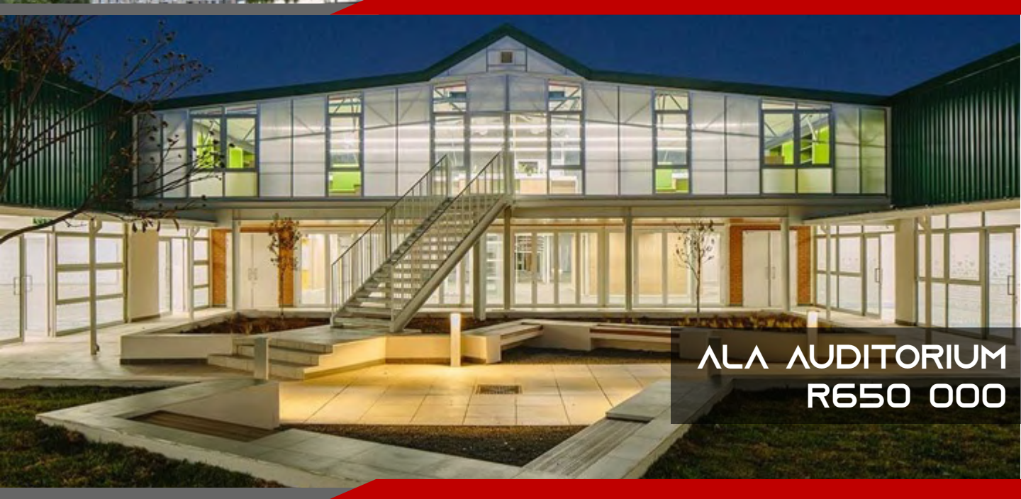
ALA AUDITORIUM R650 000