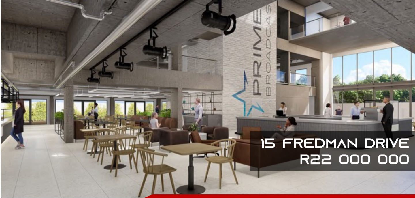
15 FREDMAN DRIVE R22 000 000