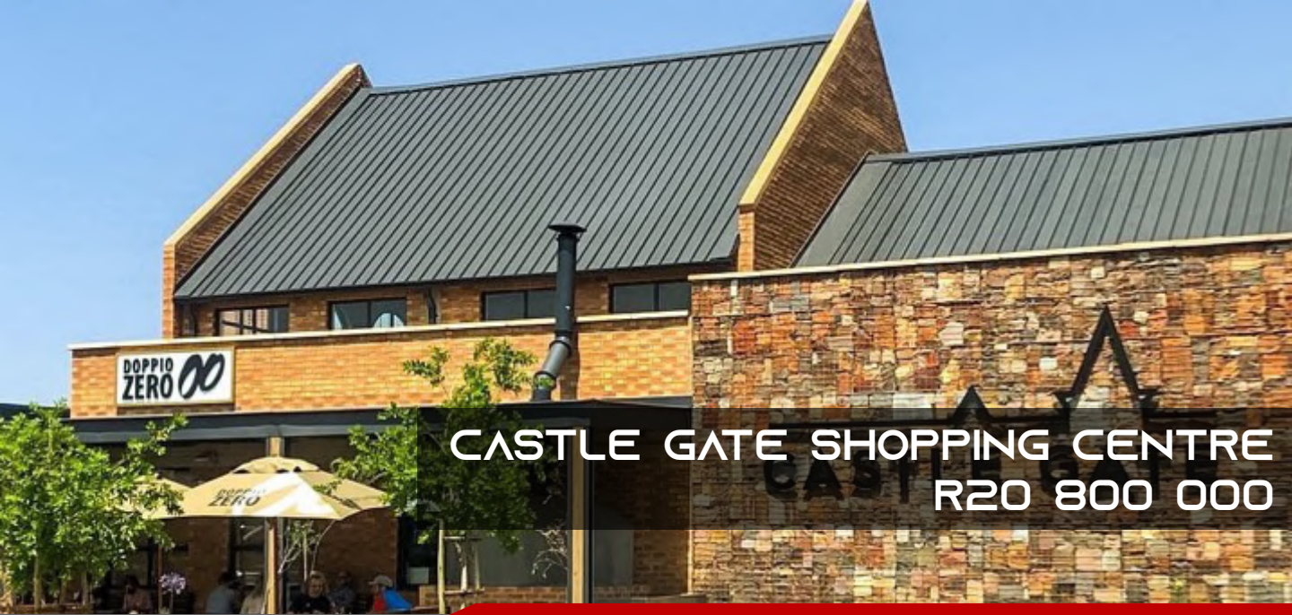
CASTLE GATE SHOPPING CENTRE R20 800 000