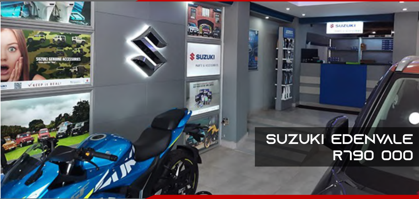
SUZUKI EDENVALE R790 000